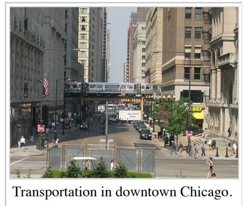
Transportation in downtown Chicago.

In order to maintain the aspect of social responsibility inherent within the concept of sustainable cities, implementing sustainable transportation must include access to transportation by all levels of society. Due to the fact that car and fuel cost are often too expensive for lower income urban residents, completing this aspect often revolves around efficient and accessible public transportation.