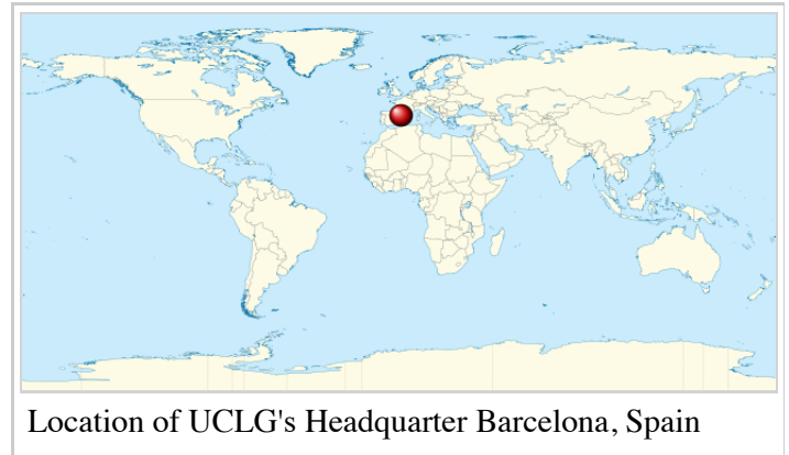
Location of UCLG's Headquarter Barcelona, Spain

Bilbao, Spain The country faced economic turmoil following the decline of the steel and port industries but through communication between stakeholders and authorities to create inner-city transformation, the local government benefited from the increase in land value in old port areas. The Strategic Plan for the Revitalisation of Metropolitan Bilbao was launched in 1992 and have flourished regenerating old steel and port industries. The conversion from depleted steel and port industries to one of Europe's most flourishing markets is a prime example of a sustainable project in action.