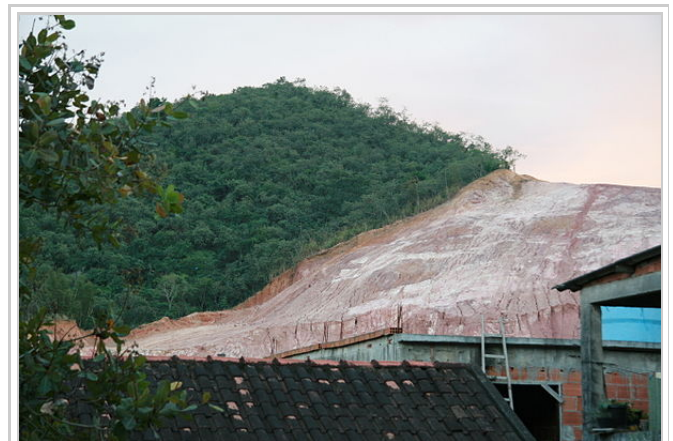
Deforestation of native rain forest in Rio de Janeiro, Brazil for the extraction of clay for civil engineering (2009 picture). An example of non-sustainable land management.

In Adelaide, South Australia (a city of 1.3 million people) Premier Mike Rann (2002 to 2011) launched an urban forest initiative in 2003 to plant 3 million native trees and shrubs by 2014 on 300 project sites across the metro area. The projects range from large habitat restoration projects to local biodiversity projects. Thousands of Adelaide citizens have participated in community planting days. Sites include parks, reserves, transport corridors, schools, water courses and coastline. Only trees native to the local area are planted to ensure genetic integrity. Premier Rann said the project aimed to beautify and cool the city and make it more liveable; improve air and water quality and reduce Adelaide's greenhouse gas emissions by 600,000 tonnes of CO 2 a year. He said it was also about creating and conserving habitat for wildlife and preventing species loss. [18]